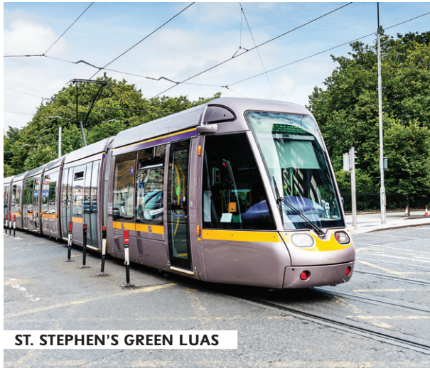
ST. STEPHEN'S GREEN LUAS