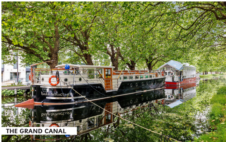
THE GRAND CANAL