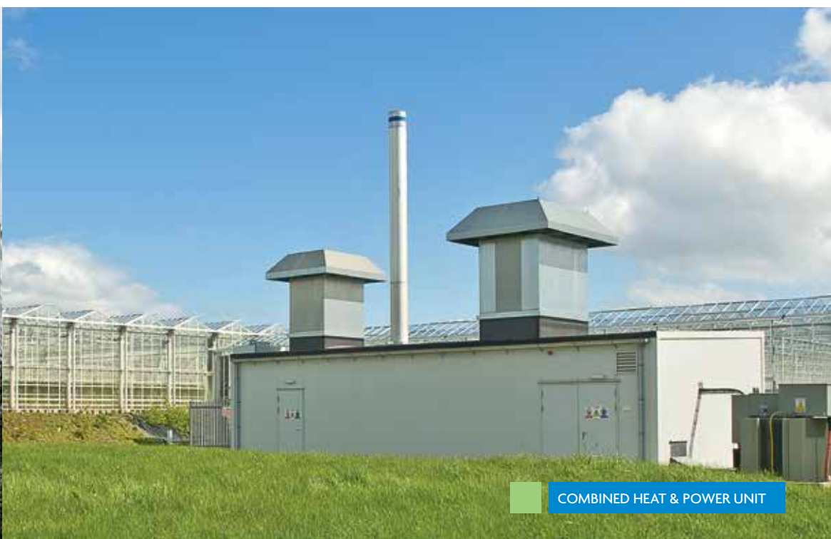
COMBINED HEAT & POWER UNIT