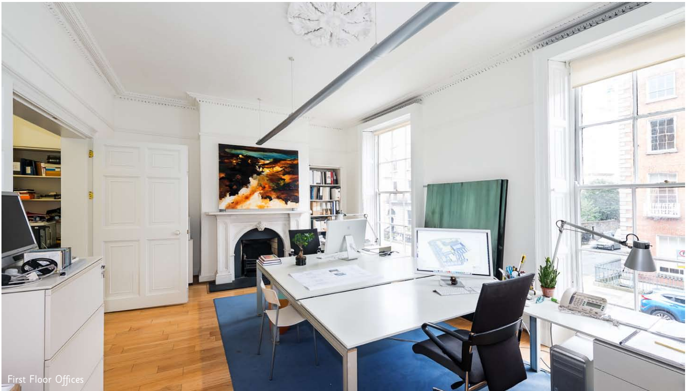
First Floor Offices