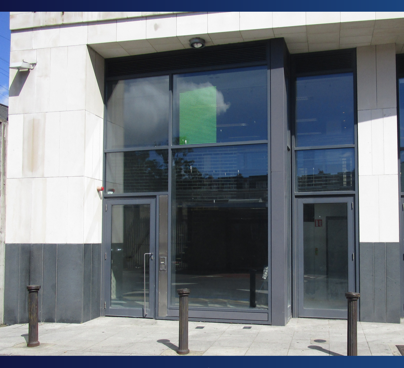
To Let - Offices

Own Door Fully Fitted Modern Offices With Parking c. 131sq.m. / 1,413sq.ft.