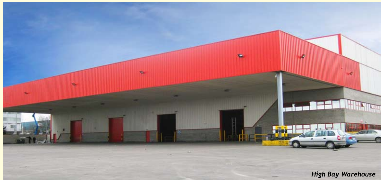
High Bay Warehouse