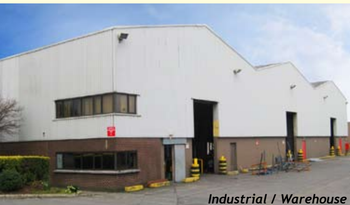
Industrial / Warehouse