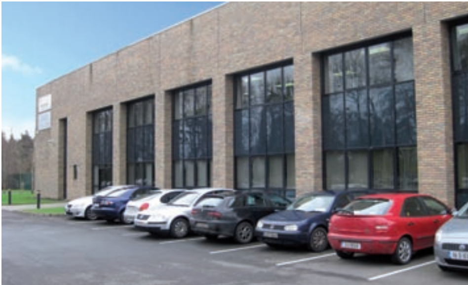
WEATHERFORD, DUBLIN ROAD, CELBRIDGE, CO. KILDARE